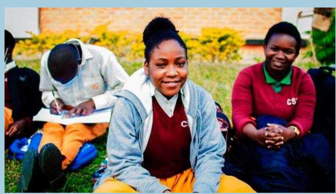
IT SCHOOLS AFRICA CHRISTMAS CHALLENGE

Admission is free and a bucket collection will be held for the Springbank Community Foodbank.