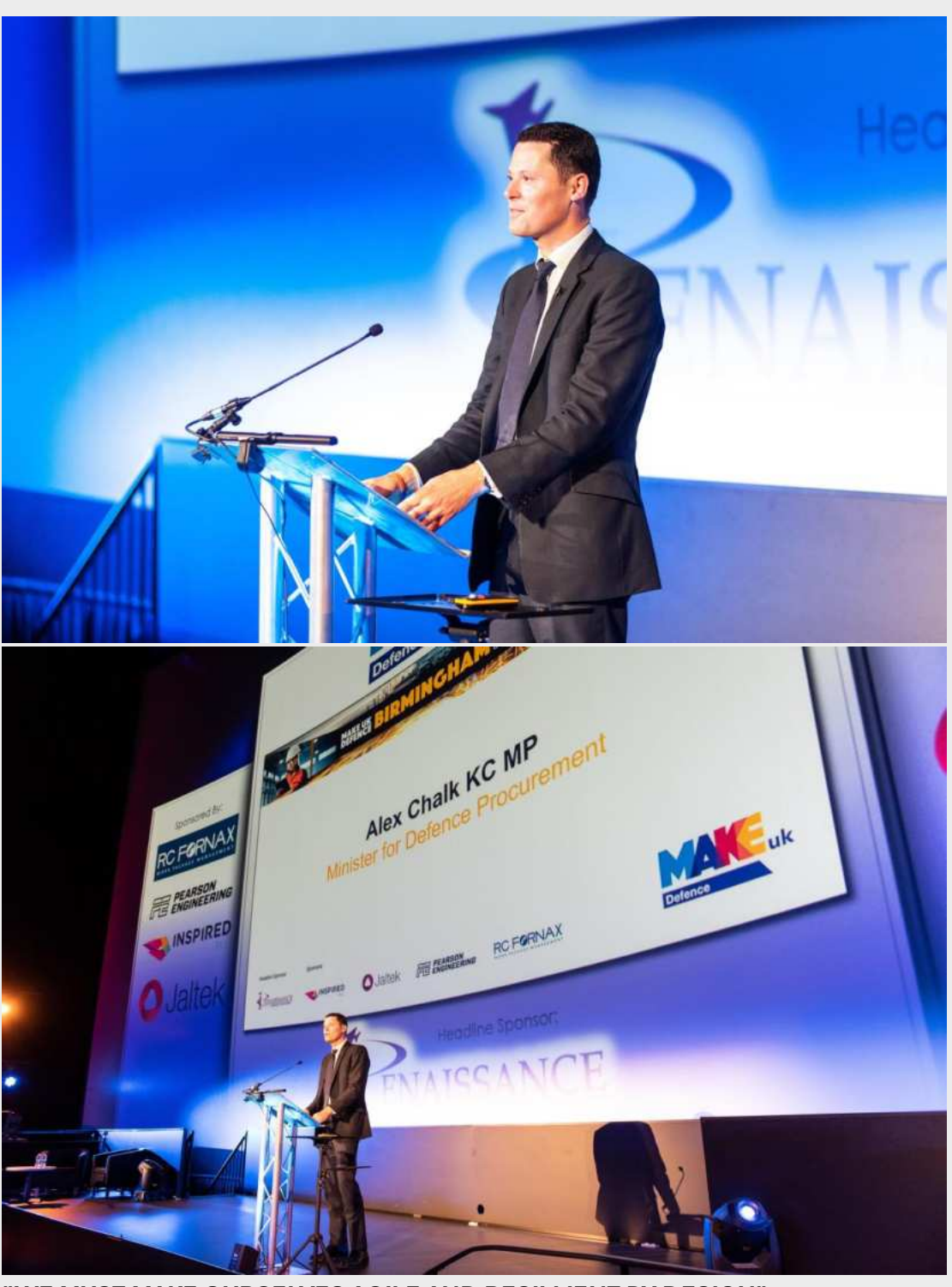
"WE MUST MAKE OURSELVES AGILE AND RESILLIENT BY DESIGN"

The focus of the discussion was how Russia's illegal invasion of Ukraine has impacted the defence procurement picture at home and overseas.