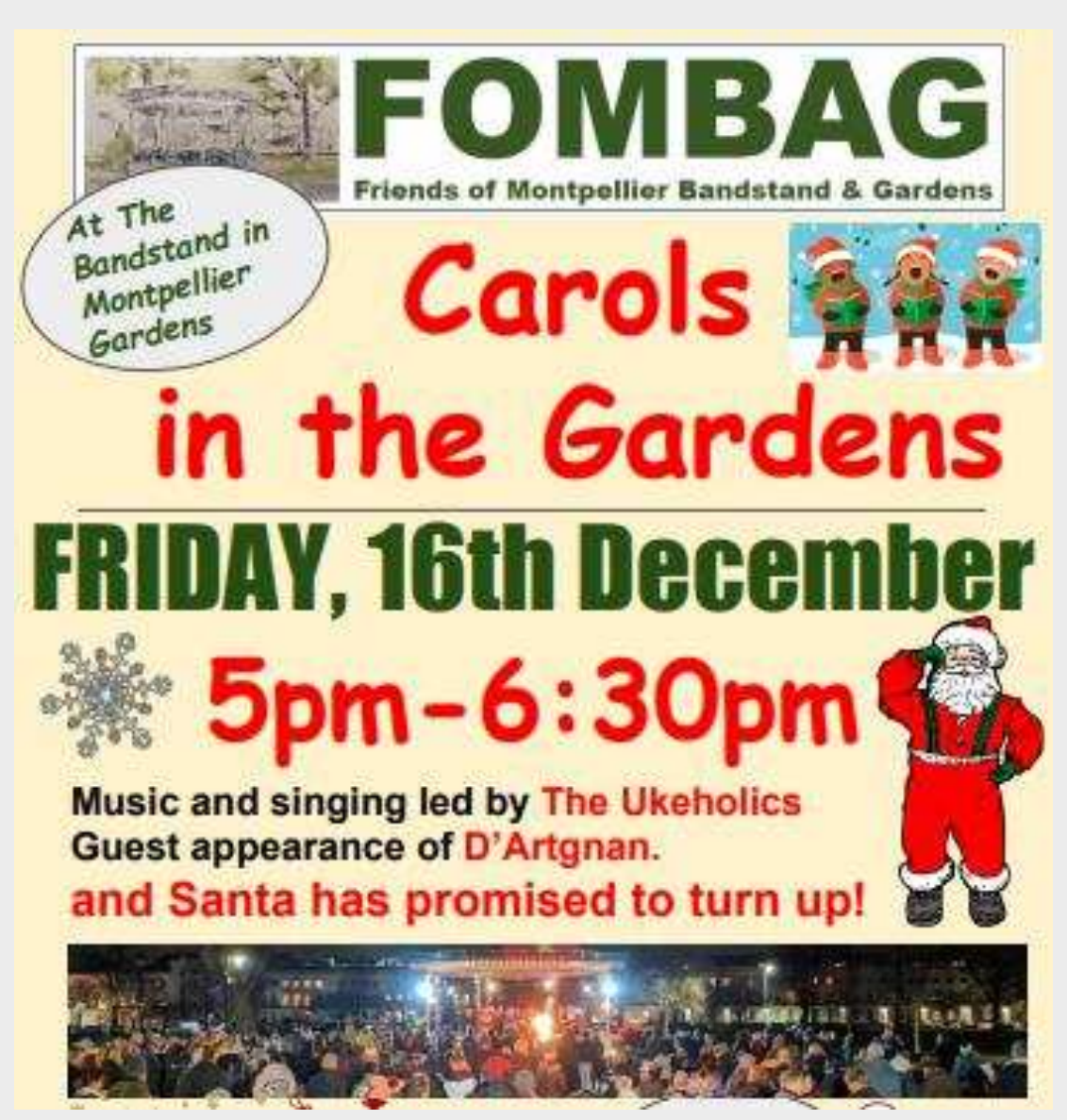
'CAROLS IN THE GARDENS' AT MONTPELLIER BANDSTAND GARDENS

Friends of Montpellier Bandstand & Gardens will again be hosting 'Carols in the Gardens' on Friday 16 December at 5pm.