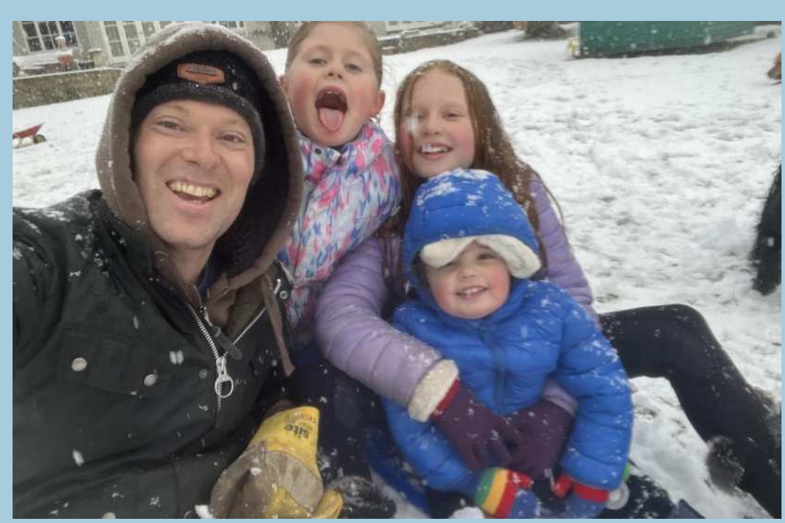
CHELTENHAM IN THE SNOW!

The run takes place every Saturday at 9am and is free to attend.