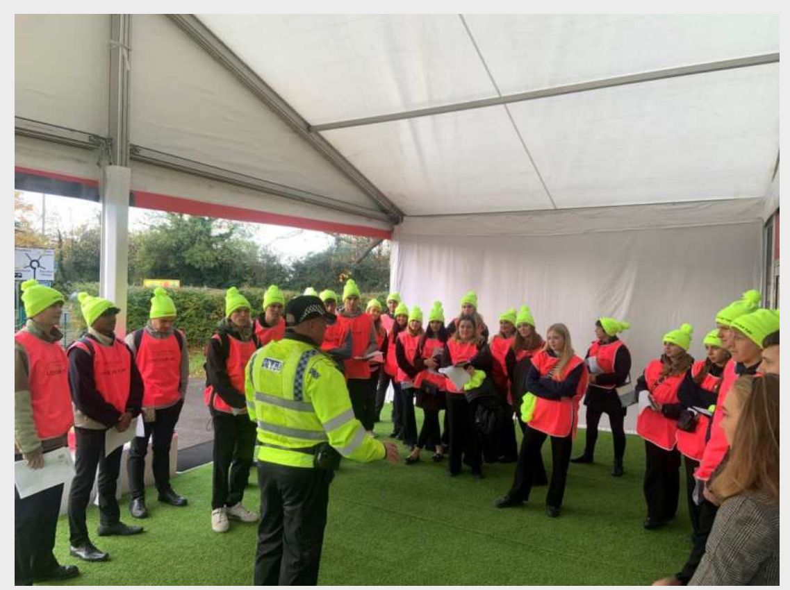
[Volunteer wayfinders receiving a briefing from the police]