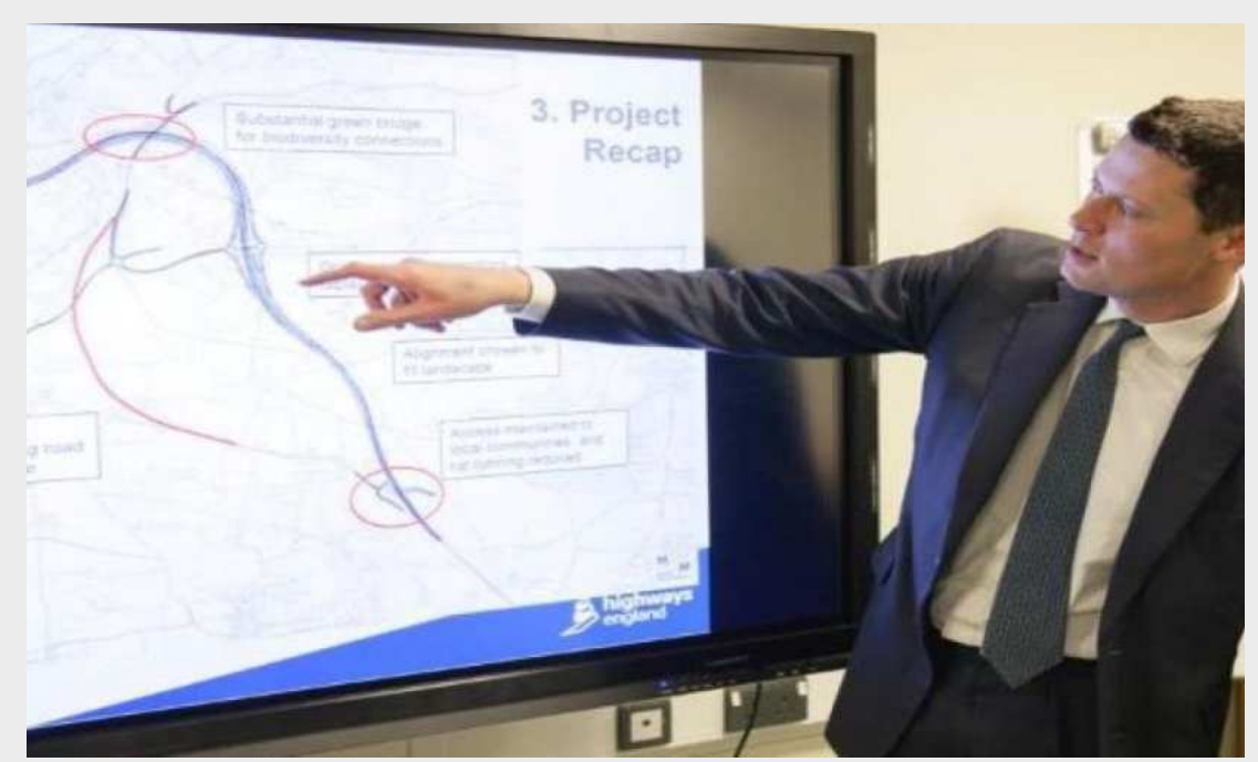
AIR BALLOON INFRASTRUCTURE IMPROVEMENTS TO BEGIN IN 2023!

The decade-long campaign to end the A417 Air Balloon traffic misery has reached the most important milestone yet: the grant of the Development Consent Order, which will allow work to begin next year.