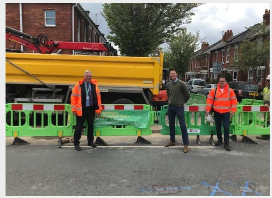
[A lex\ with\ CityFibre's\ installation\ team\ -\ picture\ taken