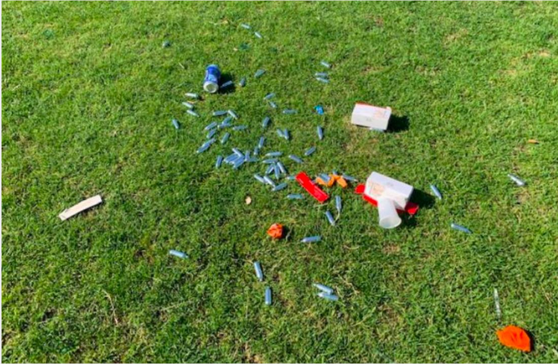
[Above: litter left behind after a Friday night in Montpellier Gardens]