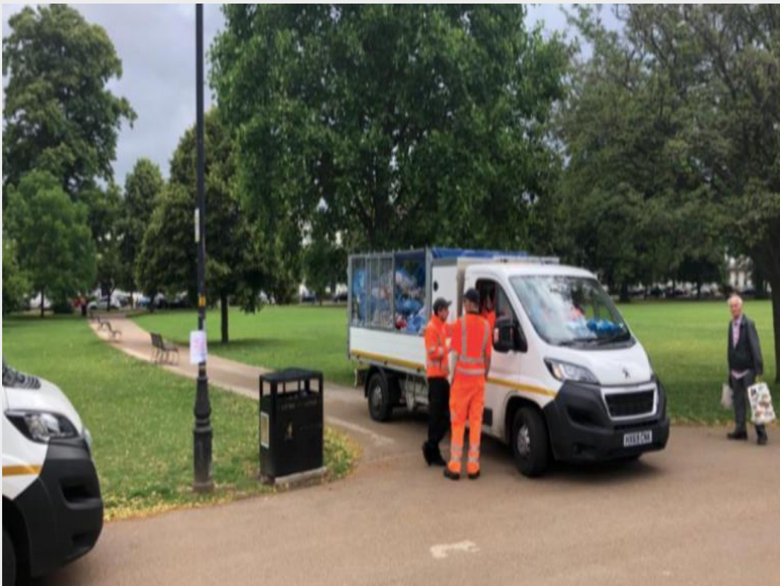
[Last Saturday morning local recycling staff put in a huge shift to clear litter from the night before]