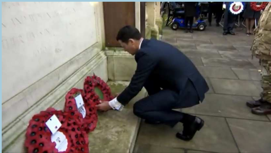
[Laying a wreath at the memorial in Cheltenham]