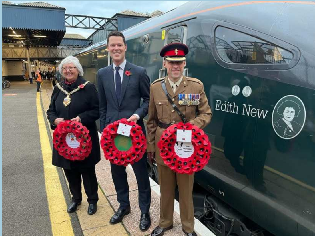
[At Cheltenham Spa Station for #PoppiesToPaddington]