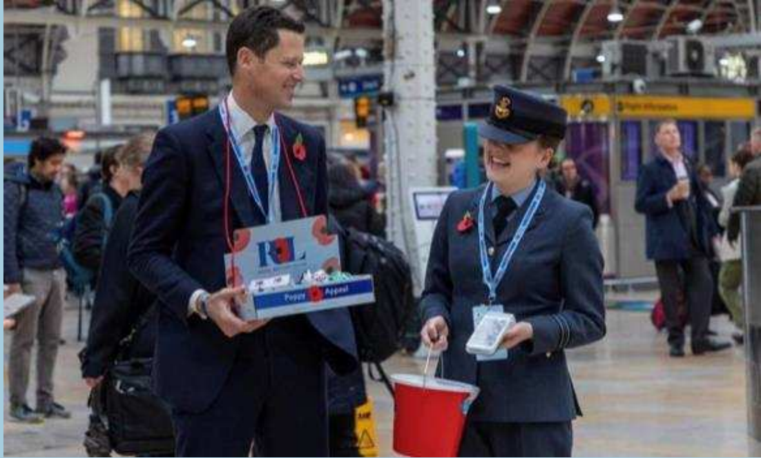
[Selling poppies with the Royal British Legion]