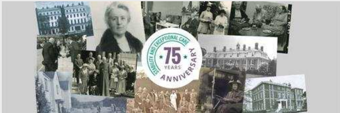
LILIAN FAITHFULL CARE CHARITY CELEBRATE 75 YEARS

If you would like to buy a Bathers Beats Cancer raffle ticket, visit galabid.com/bathersbeatscancer