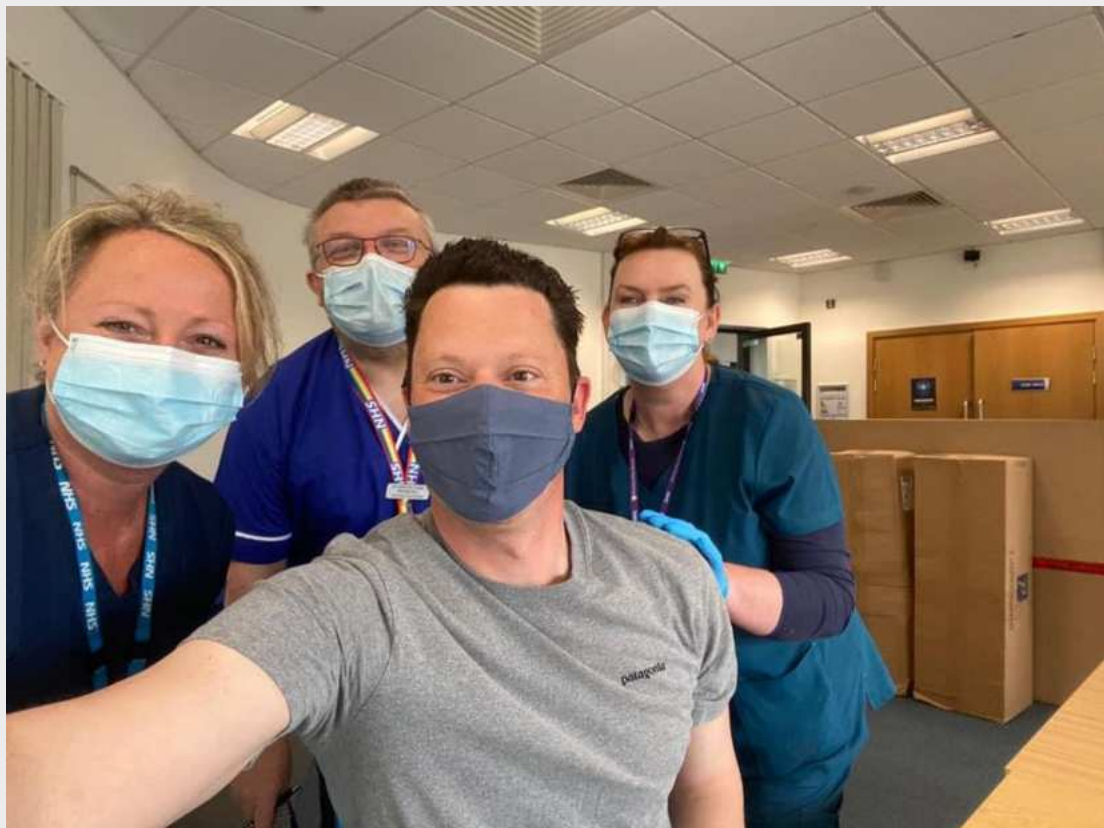
ALEX RECEIVES FIRST DOSE OF OXFORD ASTRAZENECA VACCINE

Now that the criminal court process has concluded, there must be compensation for the appalling ordeal so many innocent people have endured."