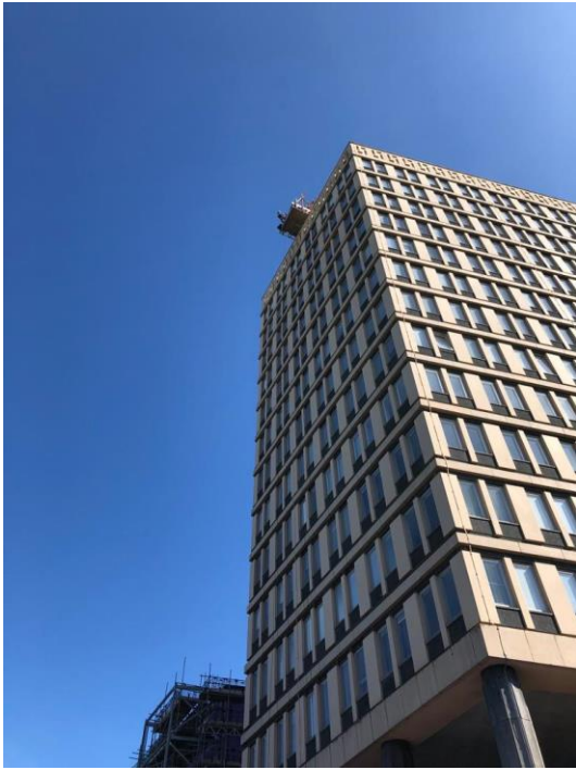
Supporting Betty as she abseils down the Eagle Tower in aid of CCP