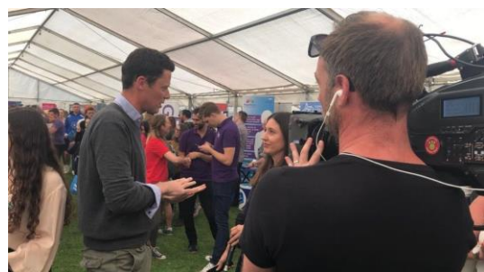
Being interview by Channel 4 at the Uni of Glos Freshers Fayre