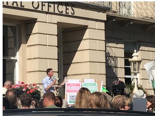
Speaking at the climate protest outside the Council offices