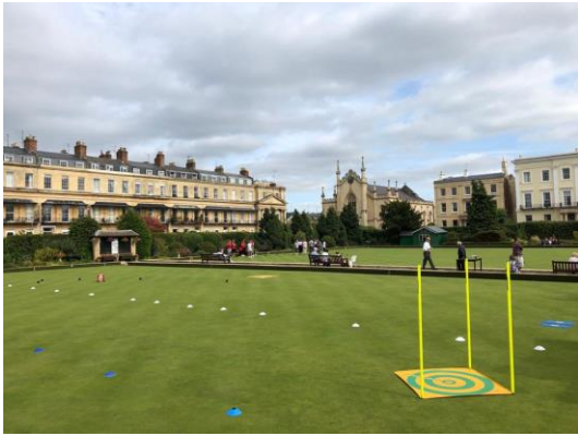
Supporting the Cheltenham Bowls Festival in Suffolk Square