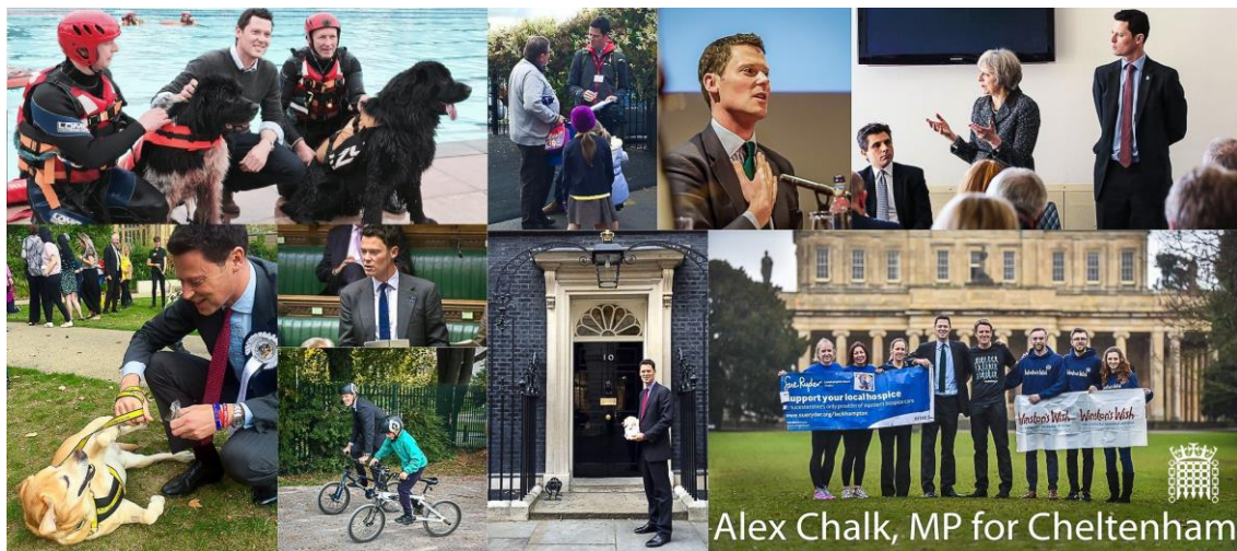
Alex Chalk, MP for Cheltenham