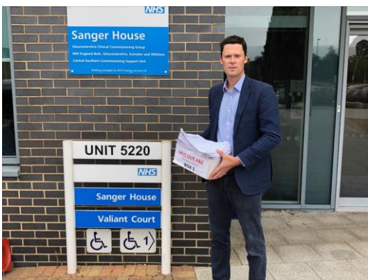
Hand delivering Save our A&E petitions to the local NHS on behalf of local residents