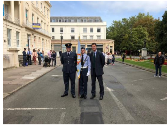
At the Battle of Britain ceremony