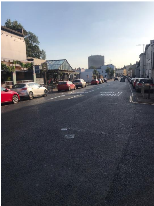
Alex has welcomed the newly resurfaced Bath Road