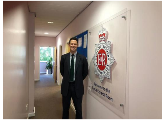
At the Force Control Room in police HQ in Waterwells