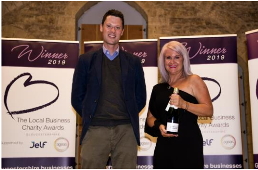
Supporting the Local Business Charity Awards