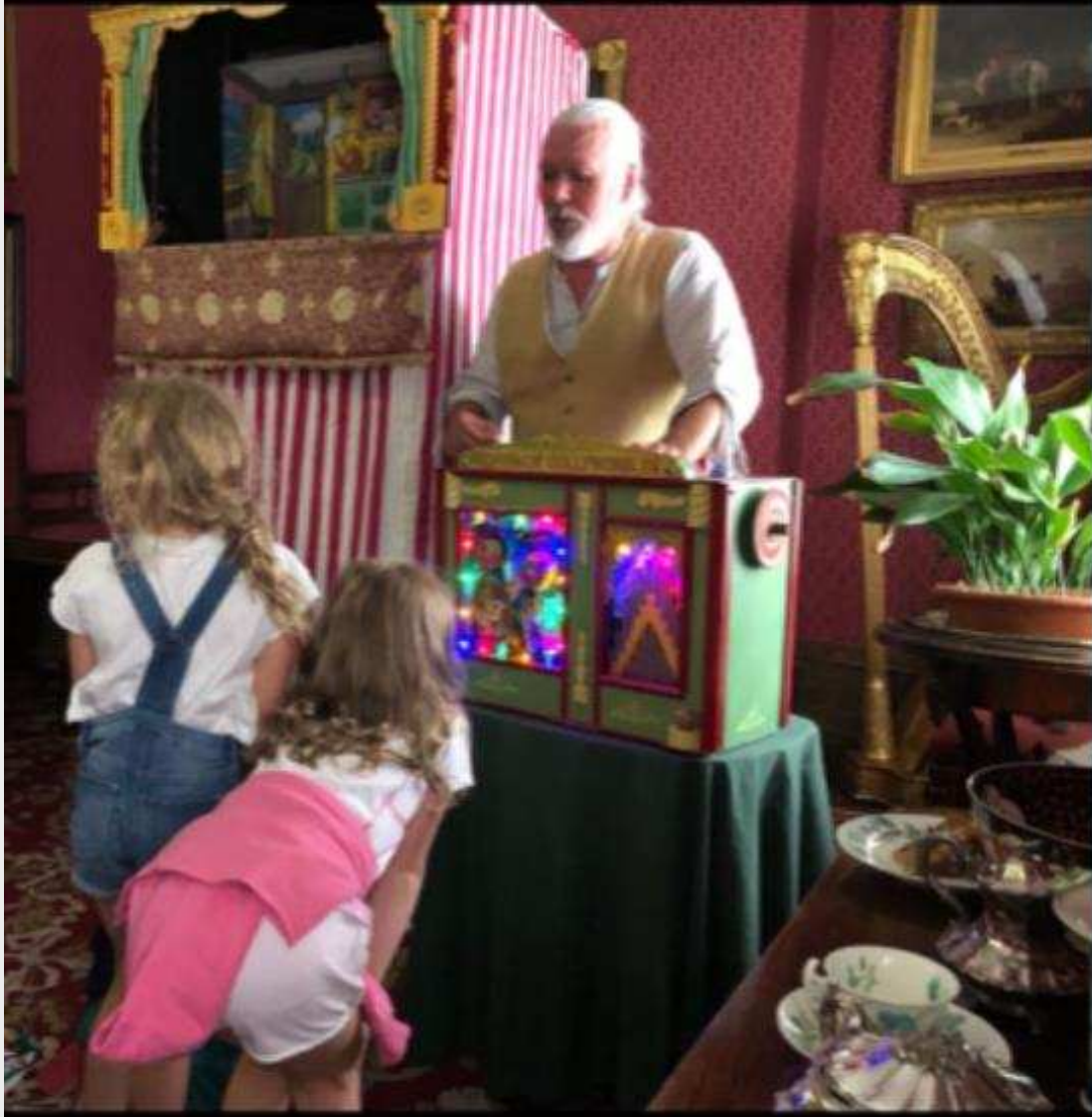
[Punch and Judy and Professor Cobbywobbles at the Holst Victorian House]