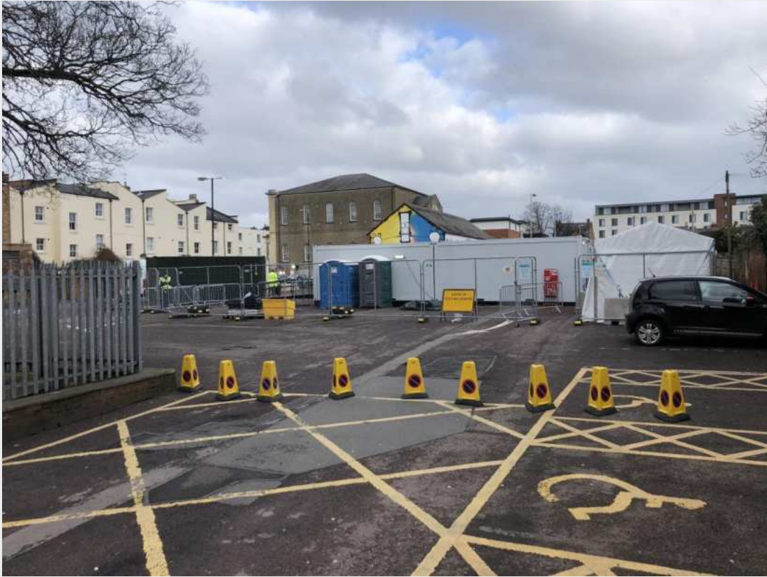
[Pictured: New testing centre off lower High Street]