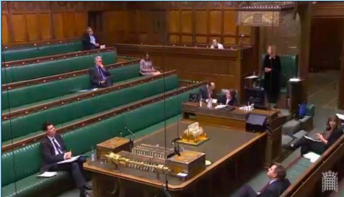
[Alex on the front bench for the Second Reading of the Domestic Abuse Bill]