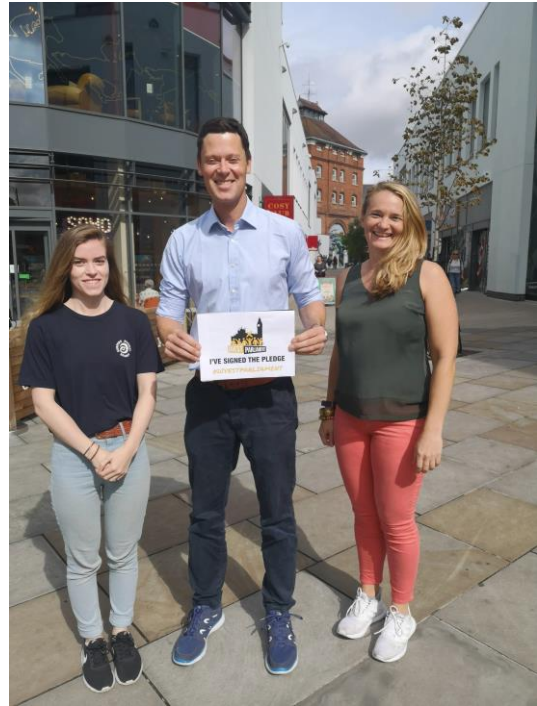
Supporting the Divest Parliament pledge