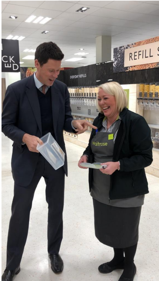
With Ange, at Waitrose's refill station