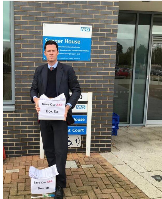
Delivering the latest batch of responses to the Engagement Process regarding the future of Cheltenham's A&E to the local NHS