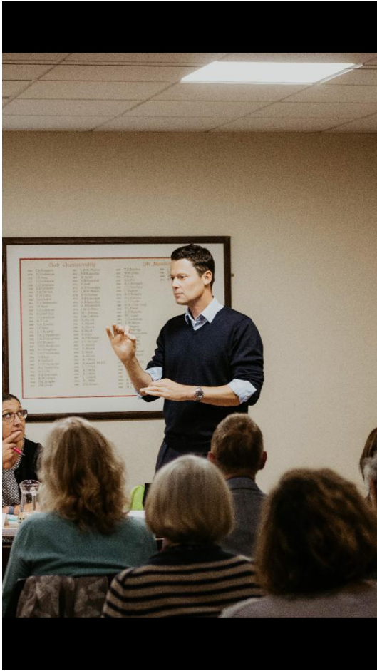
Speaking at the 'Cheltenham in the 2020s' event