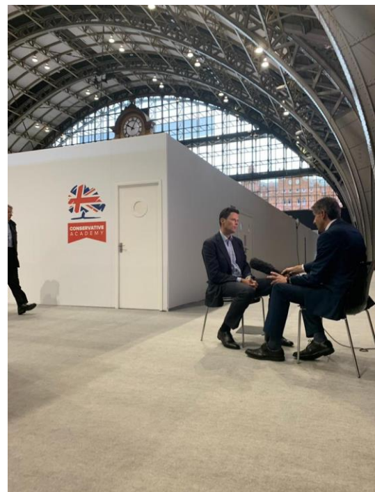
Being interviewed at the Party Conference in Manchester