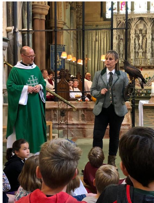
"Harvest with Hawks" at St Pip and Jim's