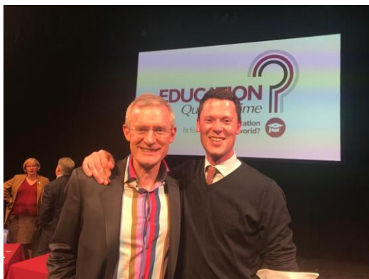
With Jeremy Vine at the Cheltenham Education Question Time debate