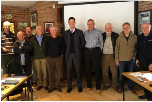
Meeting volunteers from Remap Gloucestershire