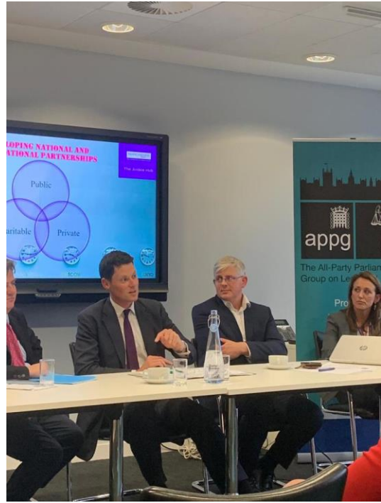
Chairing a fringe event on legal aid and pro bono law