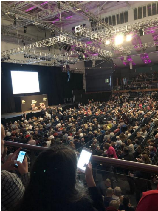
Listening to David Cameron at the Literature Festival