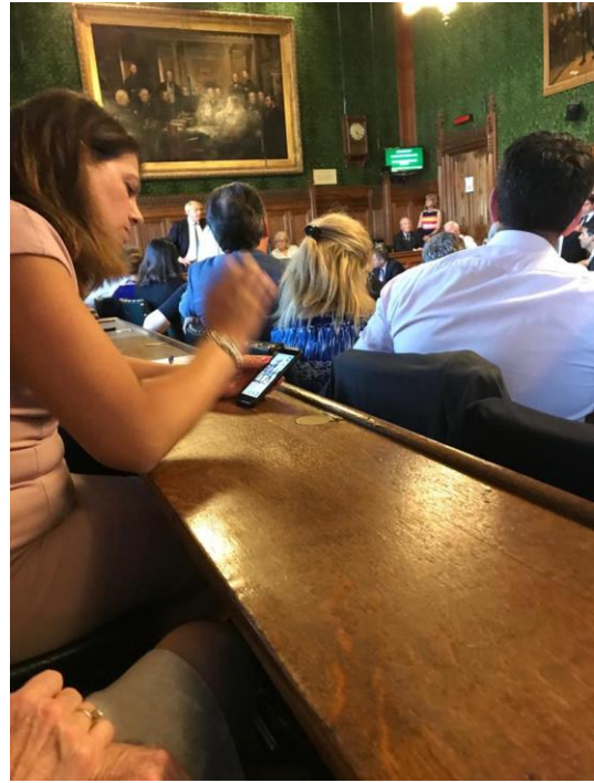
The new PM's debut at the 1922 Committee