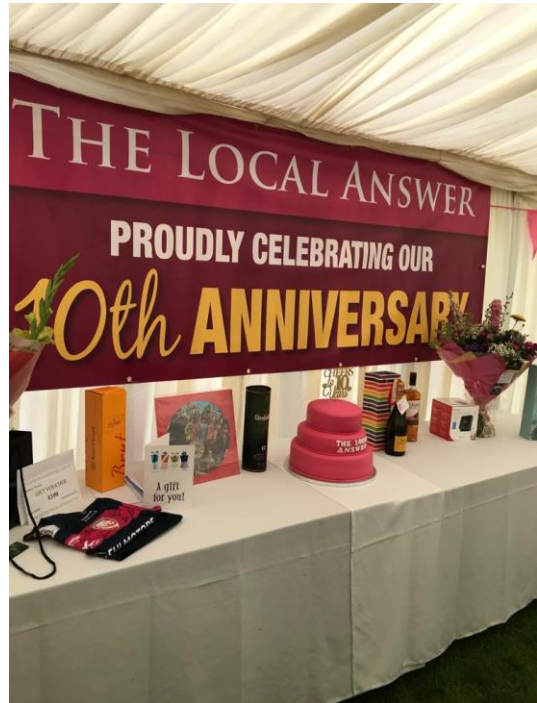
Supporting the Local Answer at the Cheltenham Cricket Festival