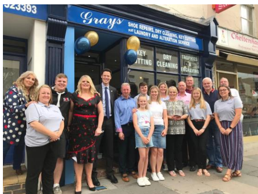
Officially re-opening Grays cobblers and dry cleaners on the Lower High Street