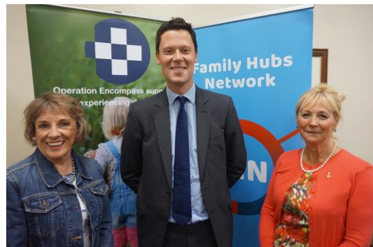
Supporting the Family Hubs Network in Parliament with Dame Esther Rantzen