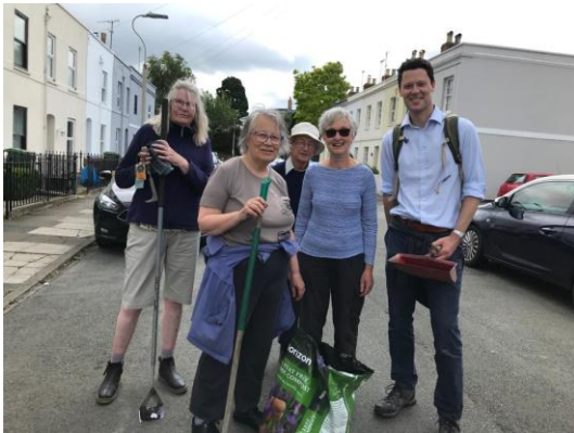
Joining local residents to clean up Tivoli and the Bournside Road area