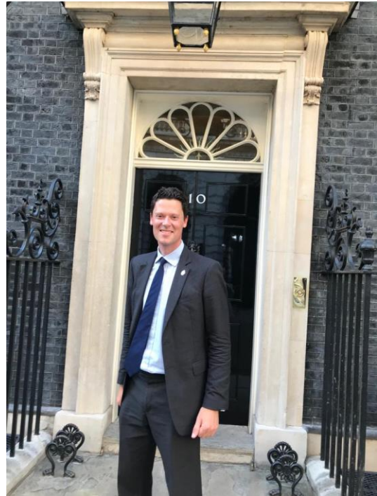
Attending Theresa May's leaving reception at No 10