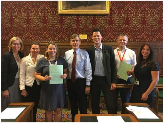
With MPs who passed the Animal Welfare (Sentencing) Bill to increase prison sentences at Committee stage.