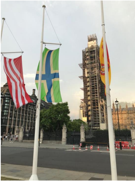
Gloucestershire's flag flying in Parliament Square - one of 50 county banners that featured last week as part of a celebration of our nation's heritage