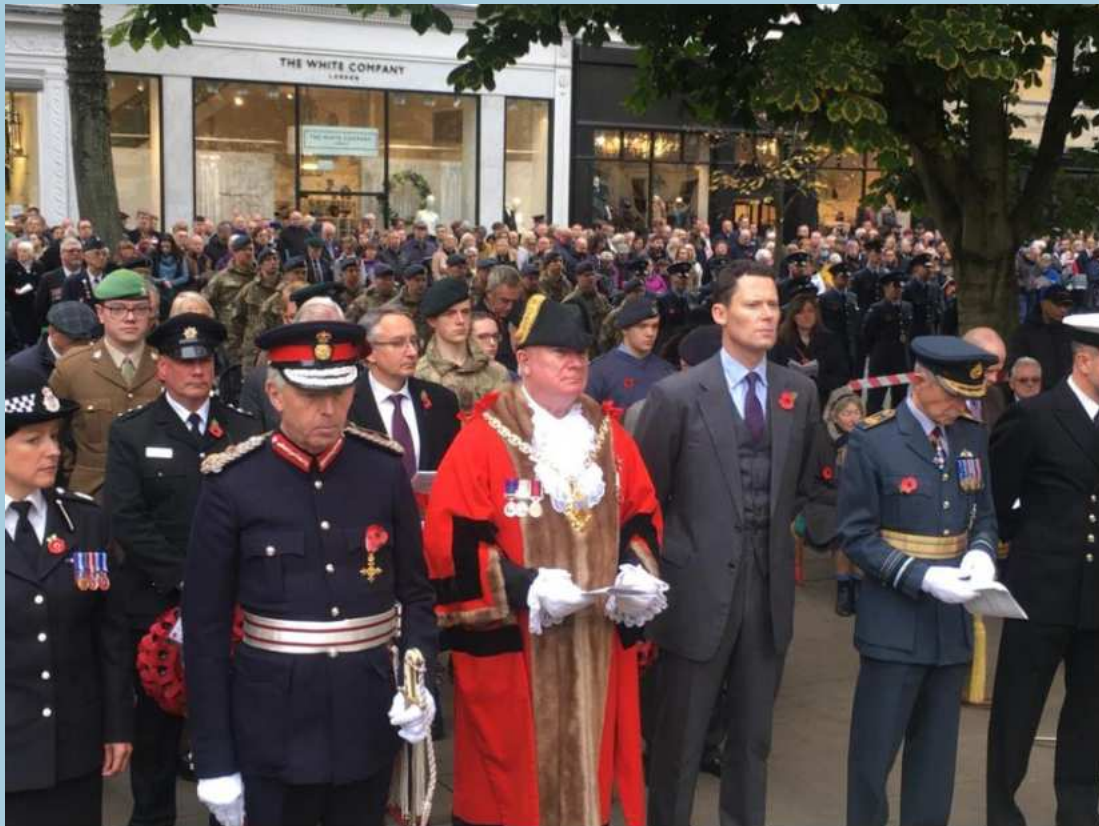
[A well attended Remembrance Parade in Cheltenham]