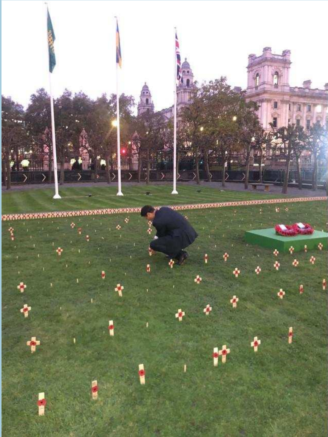
[Alex planting a wooden remembrance tribute in Westminster]