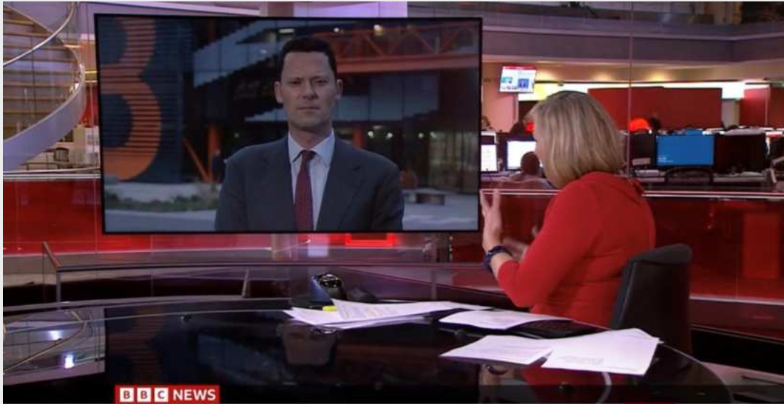
▪ WHO: China statistics 'under-represent' true impact of Covid outbreak