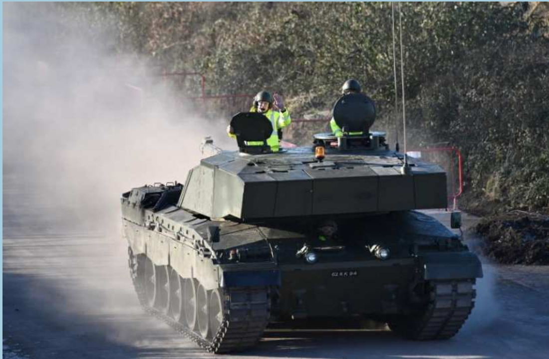
[Alex pictured in a Challenger 2 tank]

"A particular thank you to all the volunteer coaches who give up their time, week in week out, to support these young swimmers. I think you can see from their faces how much they appreciate it!"